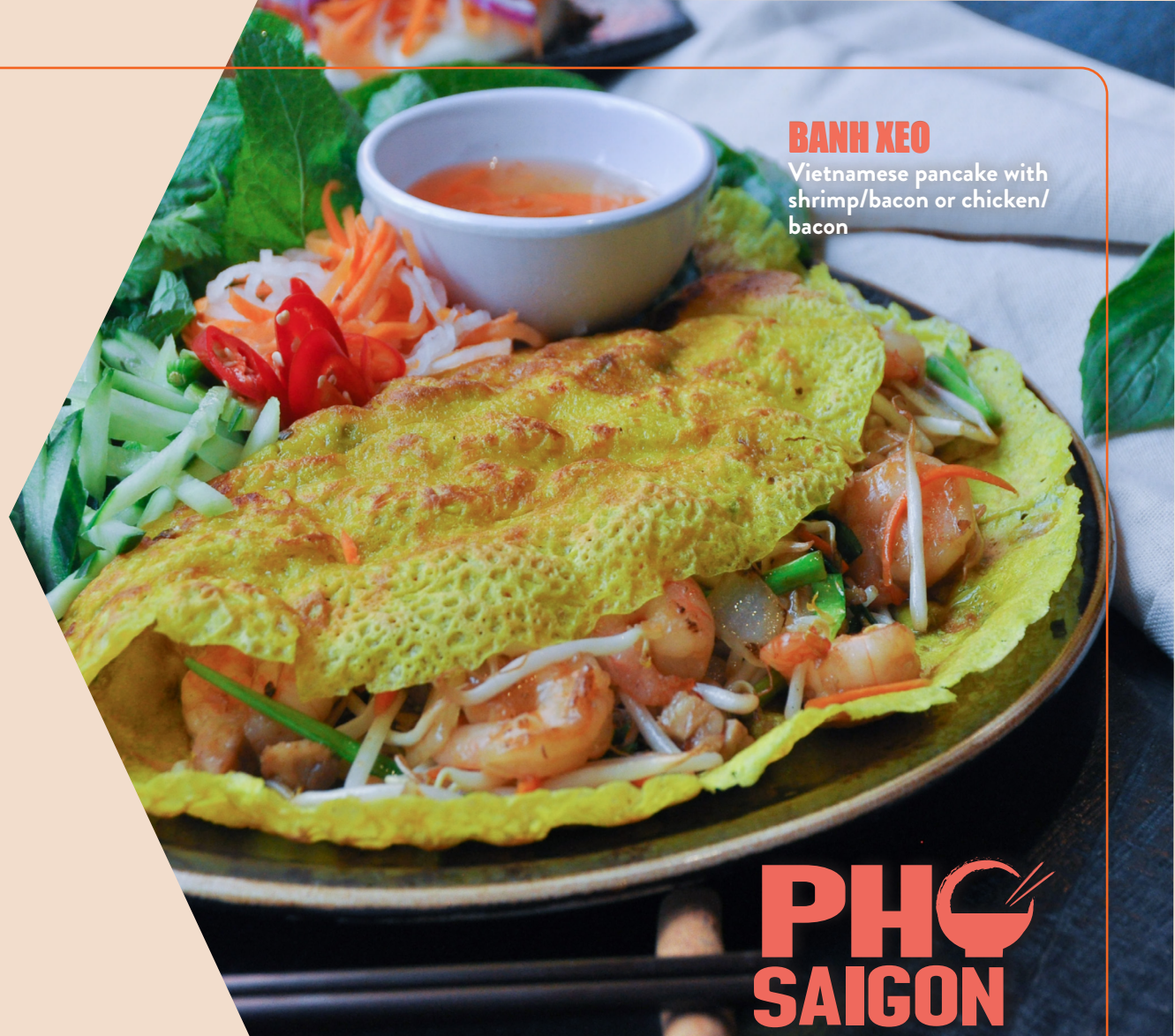
BANH XEO Vietnamese pancake with shrimp/bacon or chicken/bacon